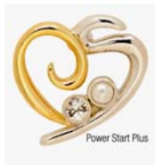
Power Start Plus