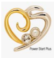
Power Start Plus