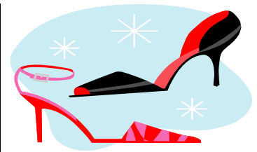
Quarterly Secret Pre-Pack Party!