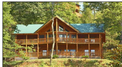
Gatlinburg Girlfriends STAR Getaway!

Details on www.julieweaver.net under Year long contests