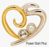
Power Start Plus