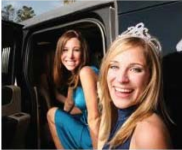
Age 15-18: The Prom (High School)