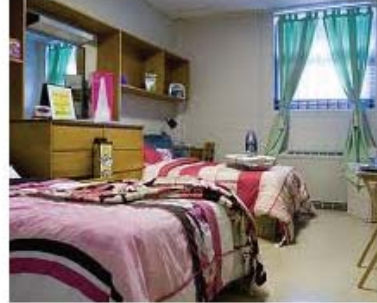
Age 18-21: The Dorm (College)